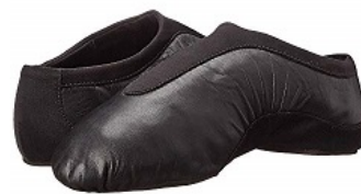
BLACK PULSE SLIP-ON JAZZ SHOES